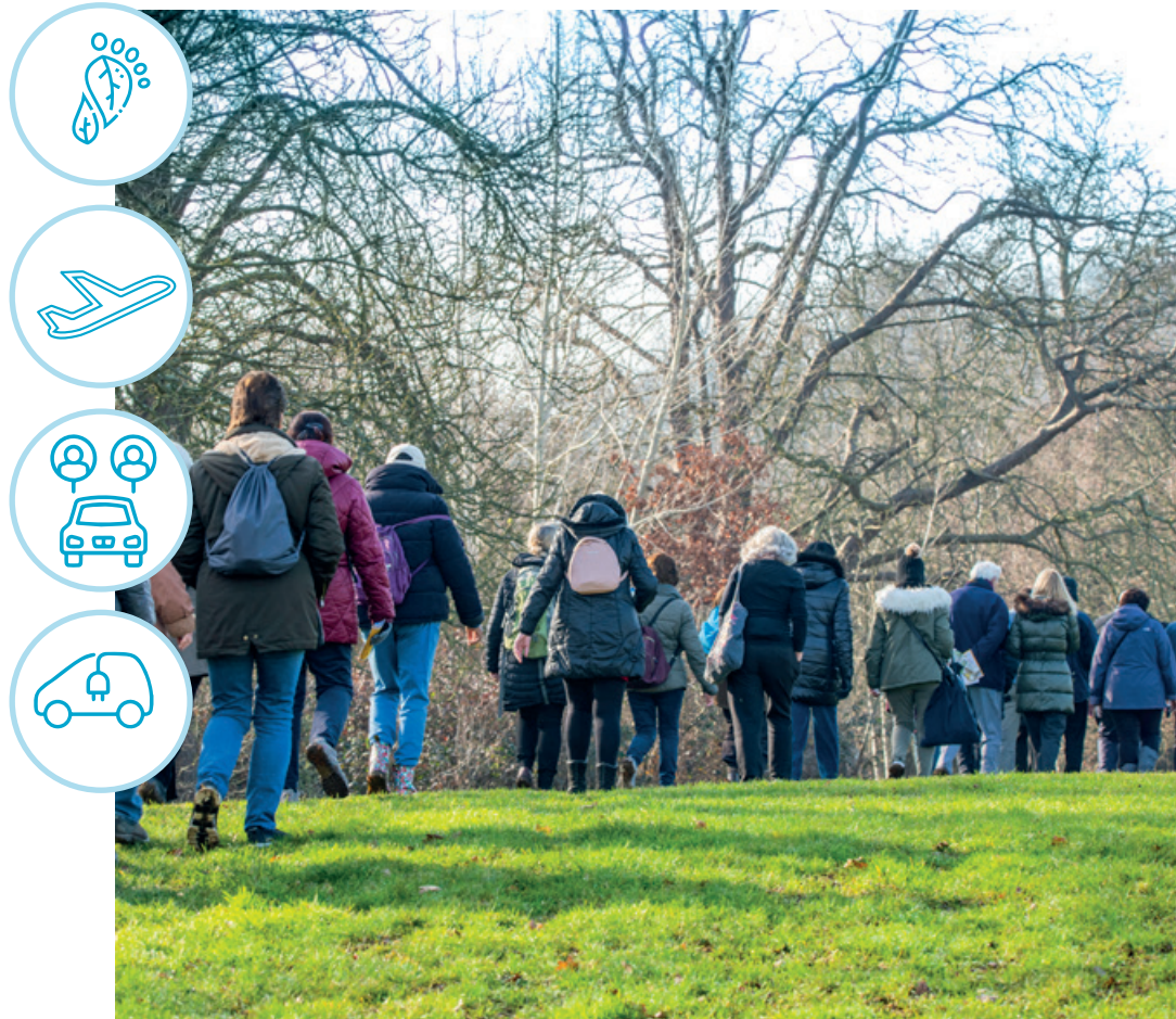
The Northwick Park Wanderers walking group out in Harrow. Find out more at https://www.harrow.gov.uk/wellbeingwalks