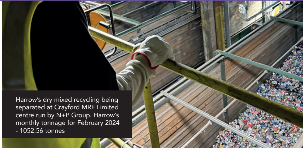
Harrow's dry mixed recycling being separated at Crayford MRF Limited centre run by N+P Group. Harrow's monthly tonnage for February 2024 - 1052.56 tonnes