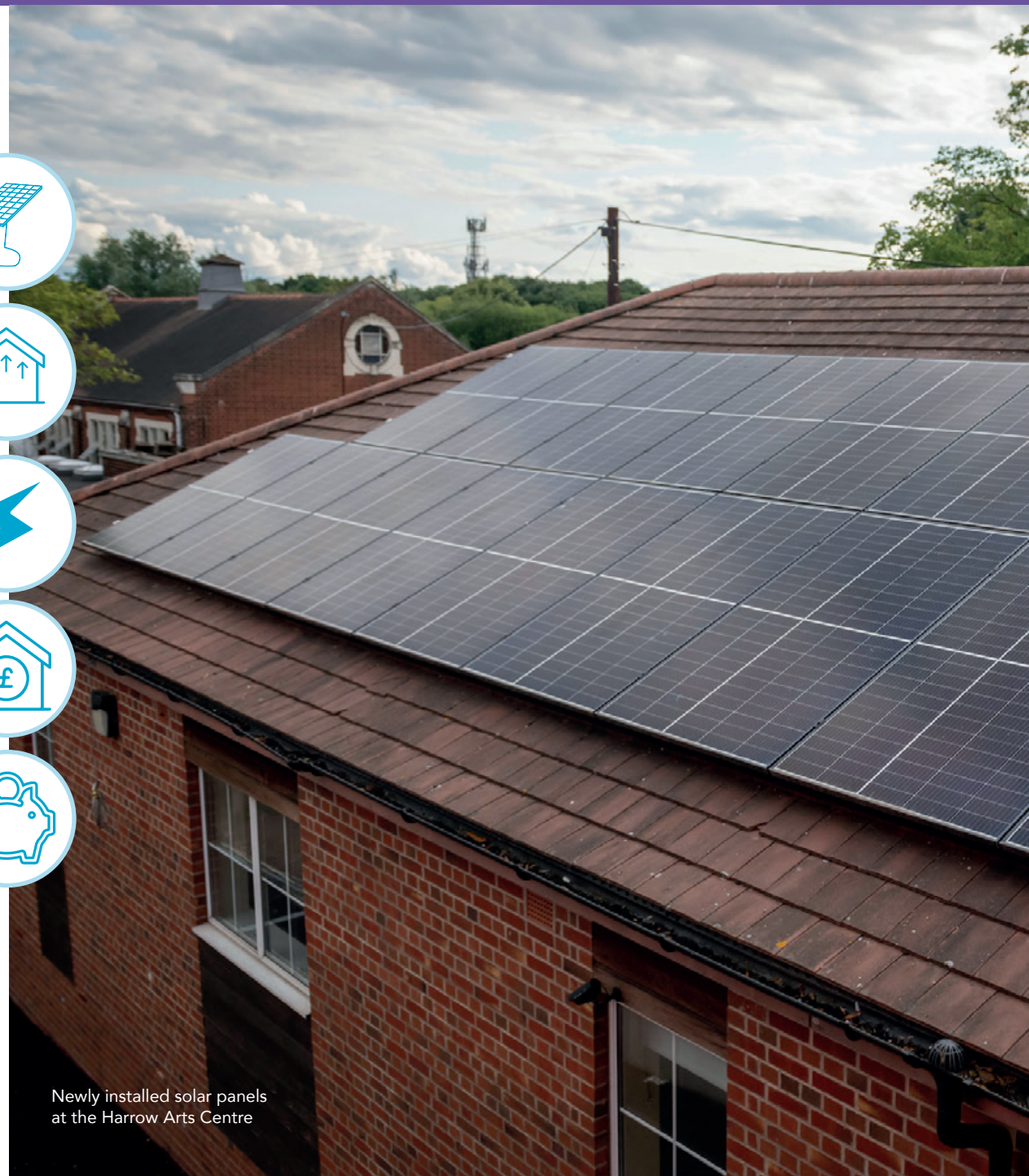
Newly installed solar panels at the Harrow Arts Centre