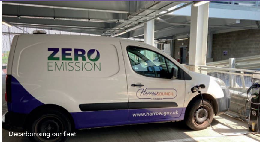
Decarbonising our fleet