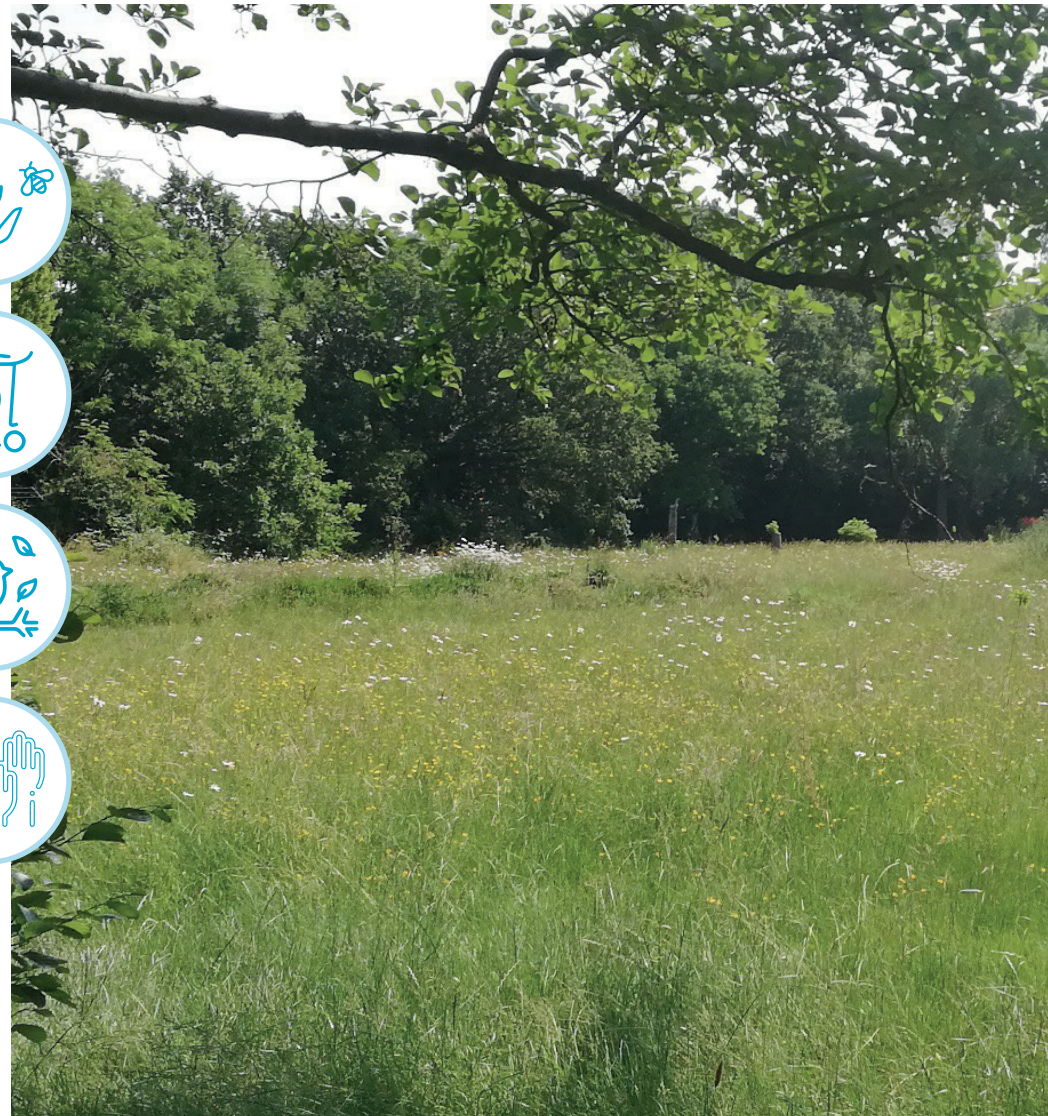
Pioneering community initiative to create London's first woodmeadow at Pinner Recreation Ground