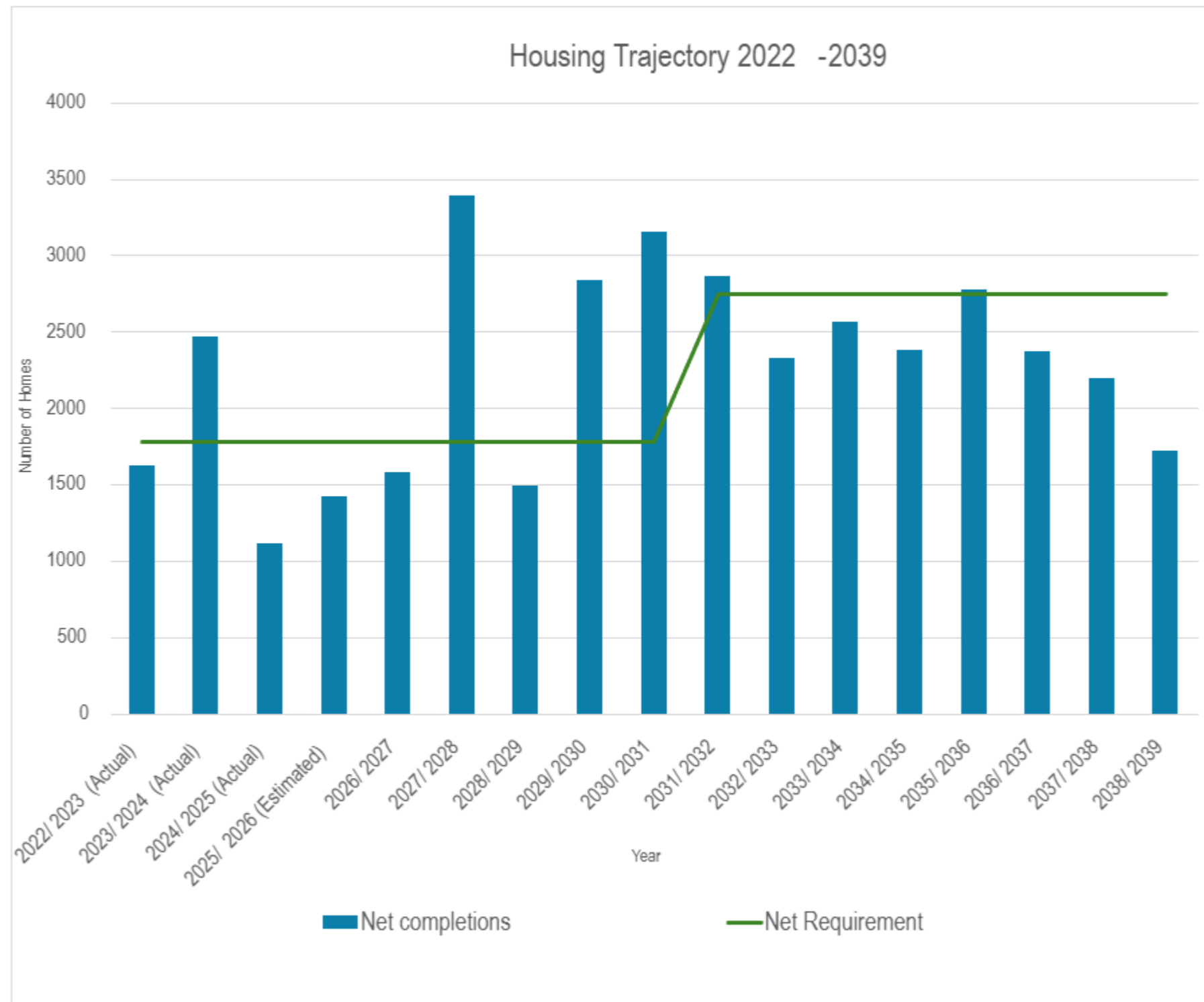
Figure 1: Housing Trajectory 2022-2039