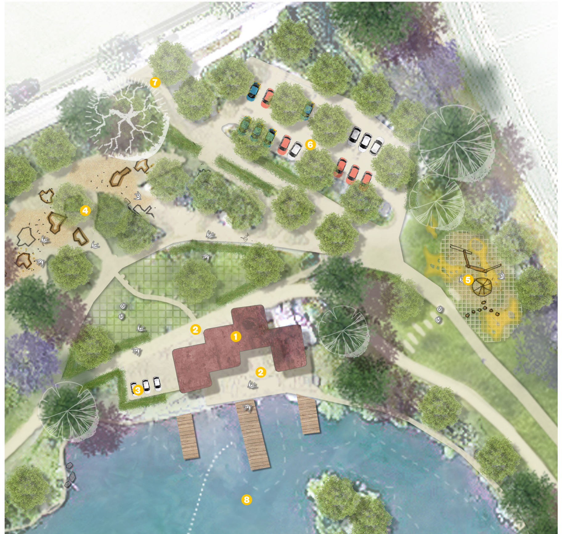
Detail area plan: The Fairlop Outdoor Activity Centre