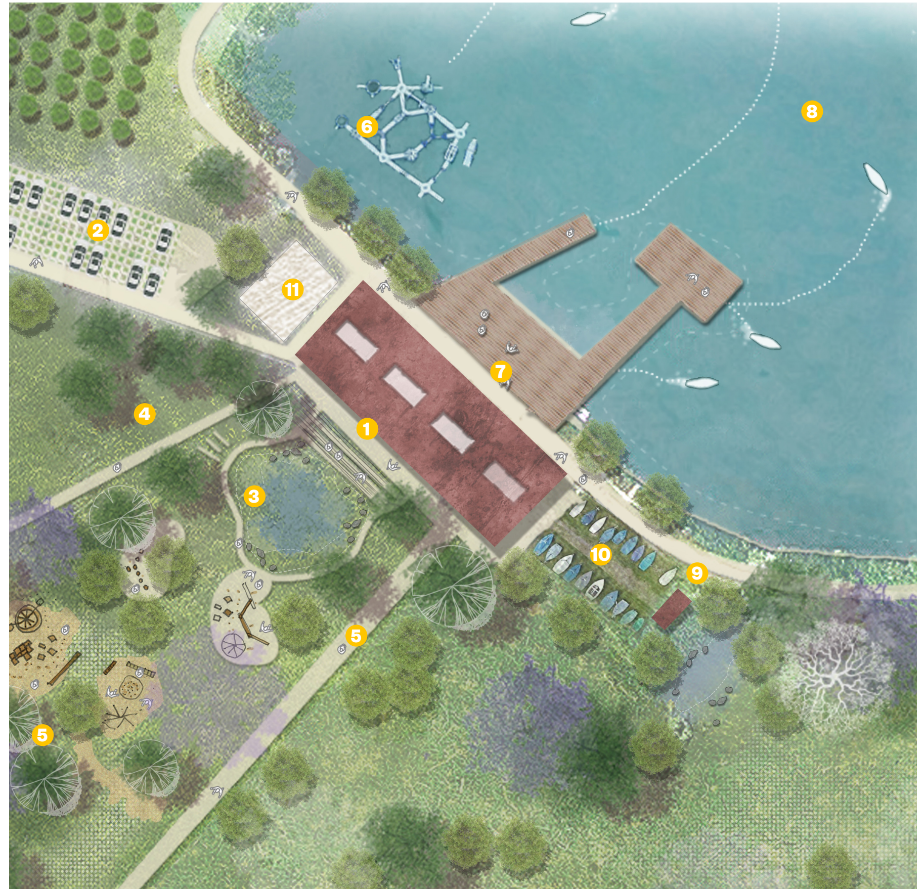
Detail area plan: The Boathouse