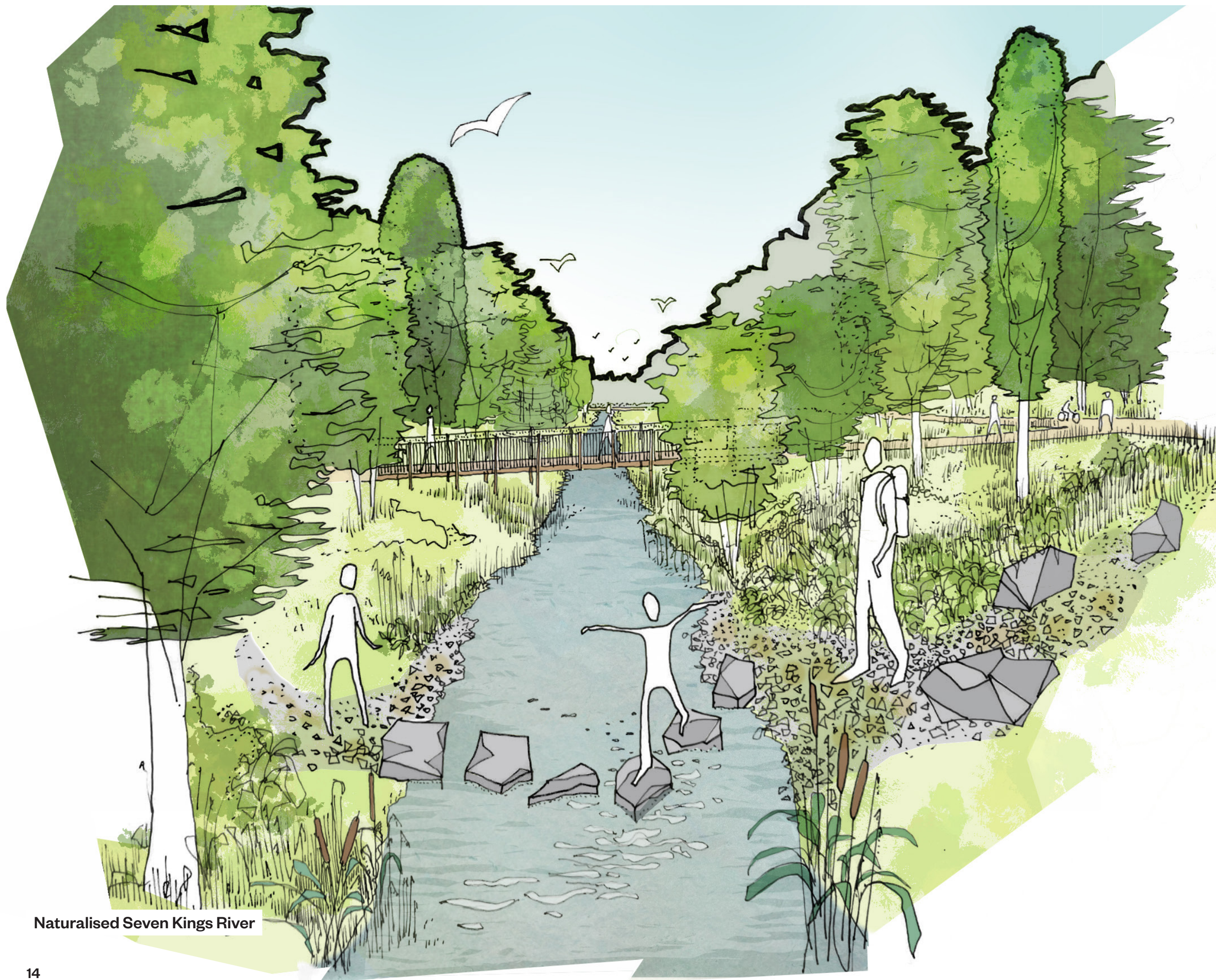
Naturalised Seven Kings River