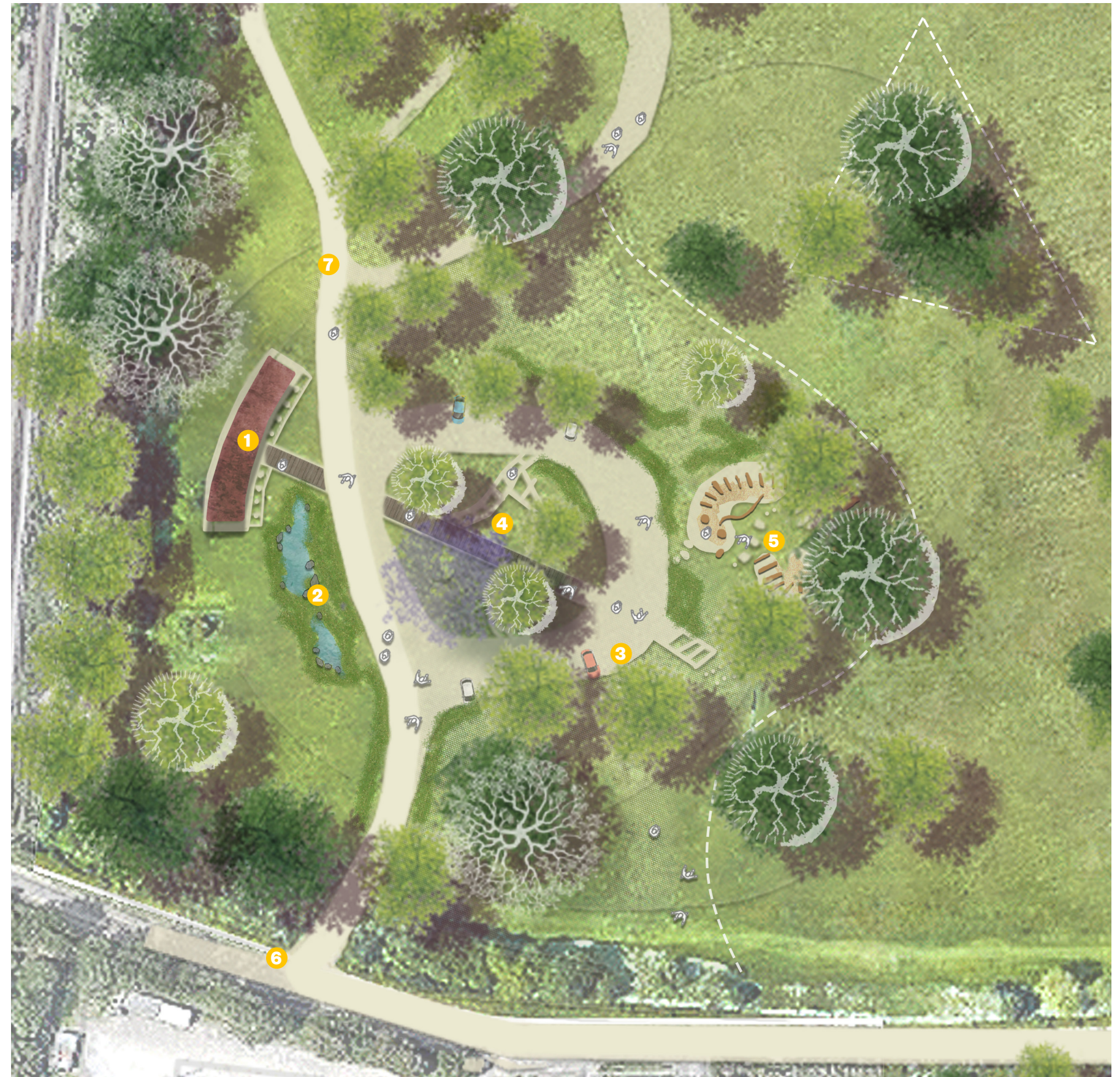
Detail area plan: Barkingside entrance