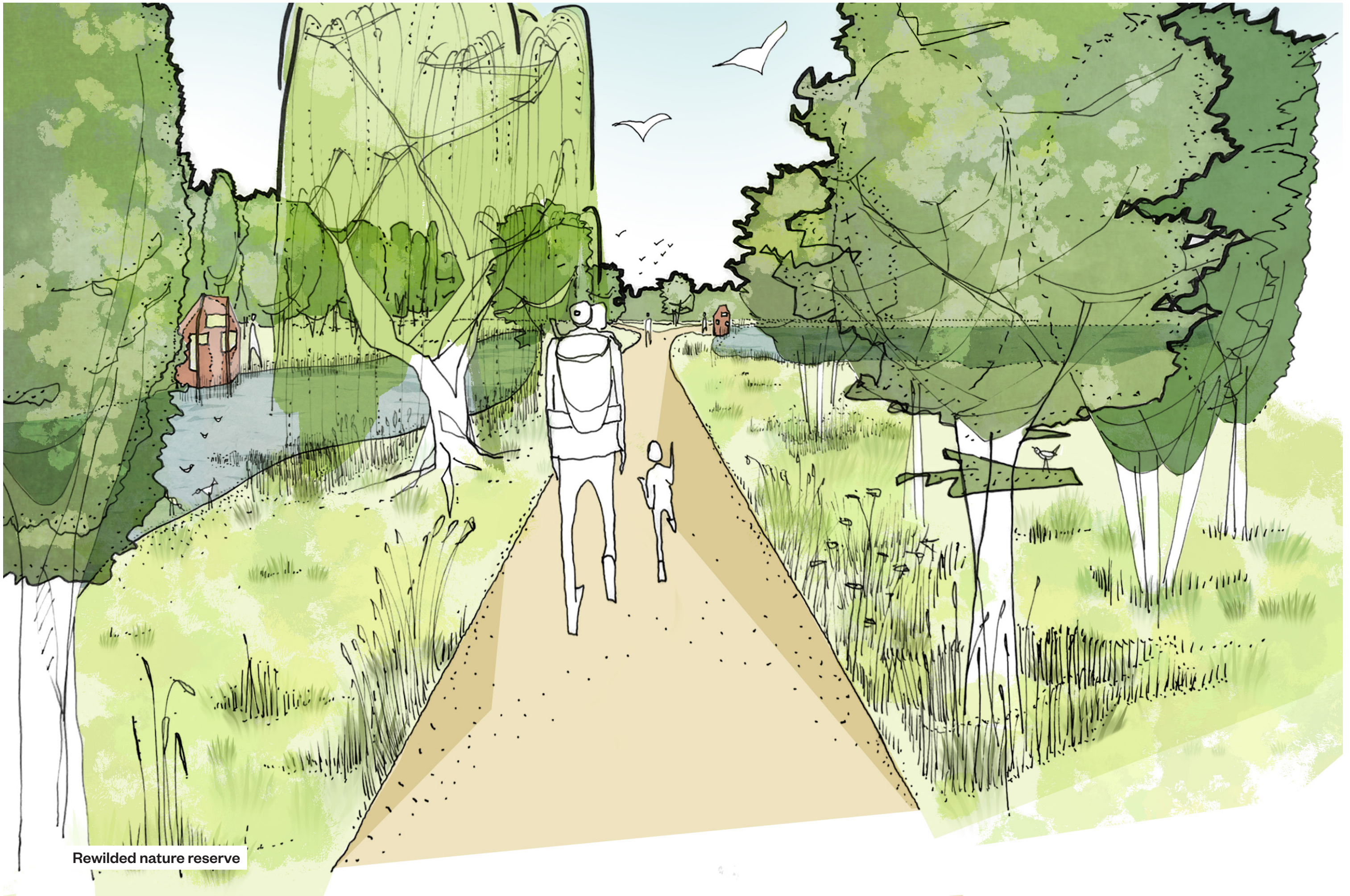
Rewilded nature reserve