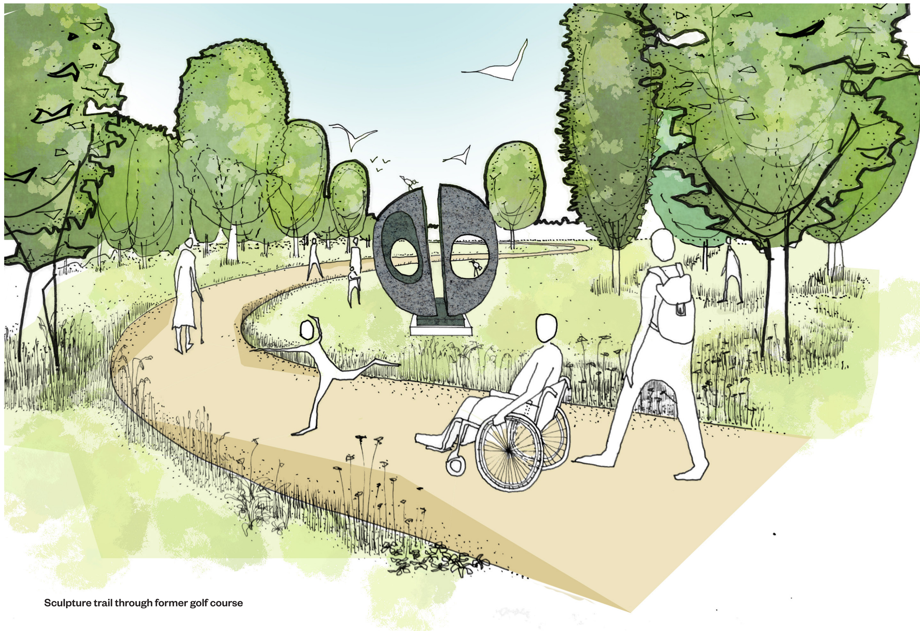
Sculpture trail through former golf course