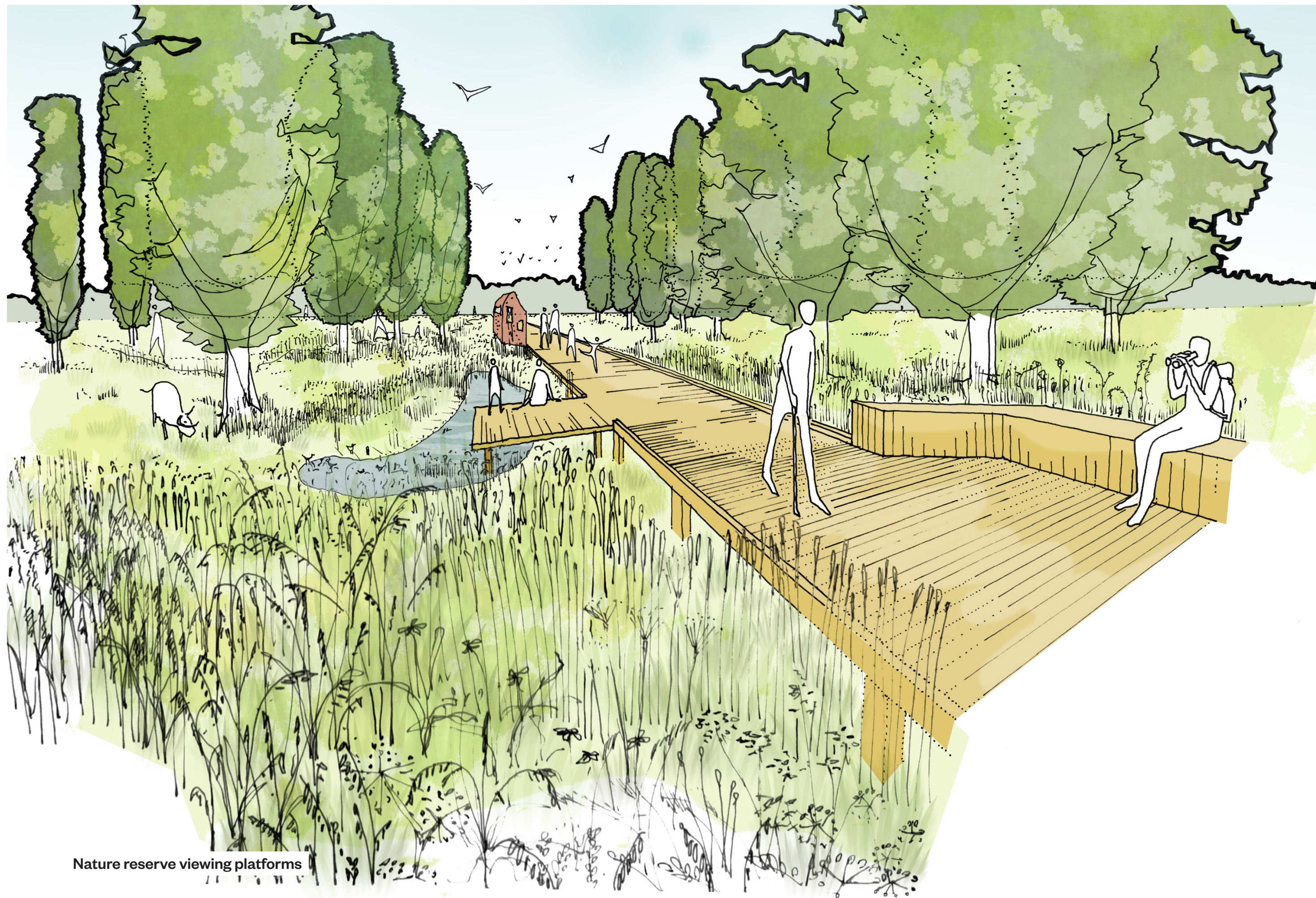
Nature reserve viewing platforms