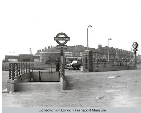
Eastern Avenue c. 1956.