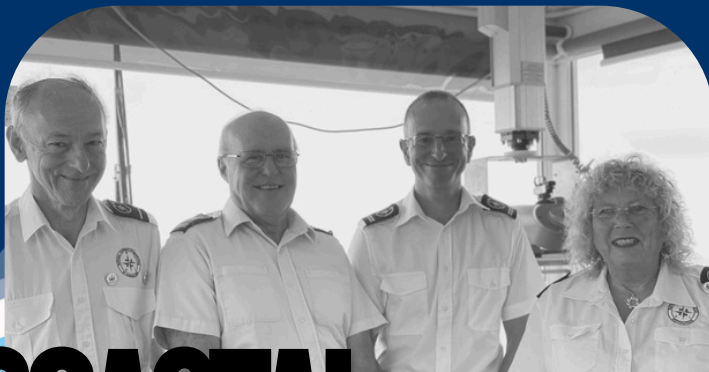
The Team from the National Coastwatch Institution (NCI), St Alban's Head, Worth Matravers – featuring in Dorset Coast Forum's Coastal Life Stories touring exhibition autumn 2025

Wednesday 1 October Flooding Swanage with Art panels reinstall begins on the temporary wave barriers along the seafront (in situ until Spring 2026)