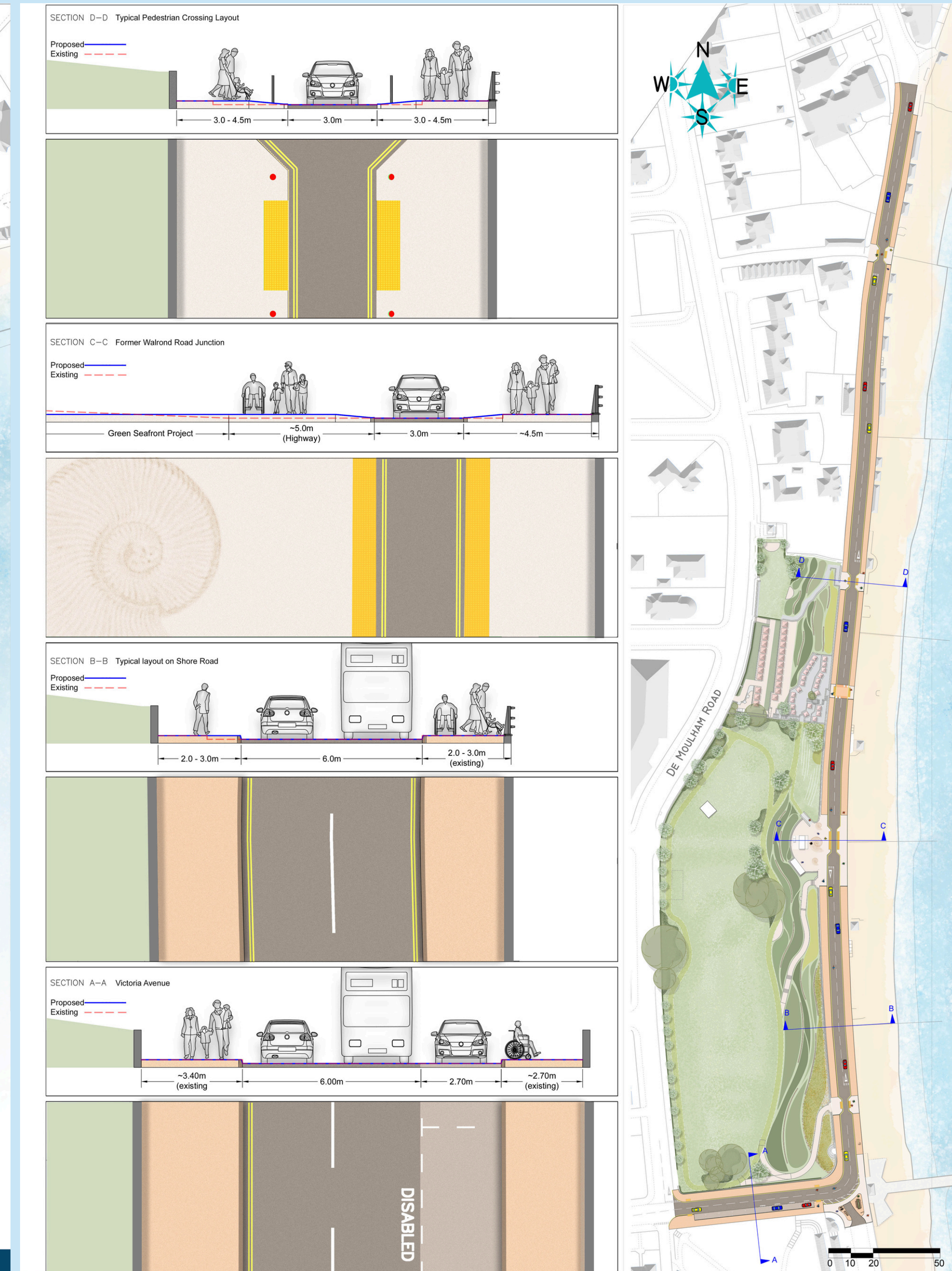
Dorset Council Shore Road, Swange - Option 3: Two-Way Traffic with Parking Removed